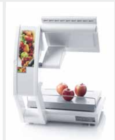
KH 800 SV Customer perspective