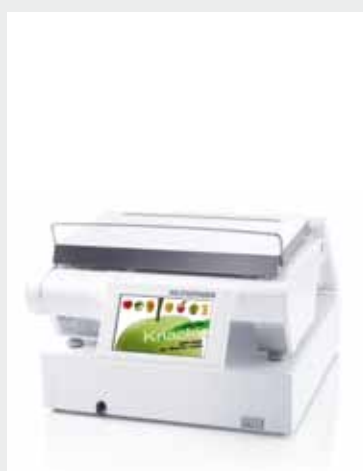
KH 100 with CD* Customer perspective