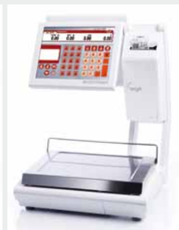
KH 800 2S