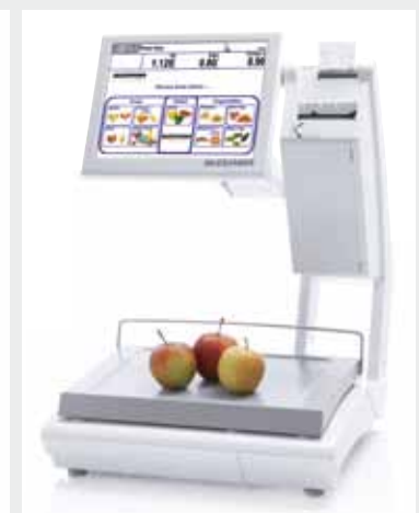
KH 800 SV