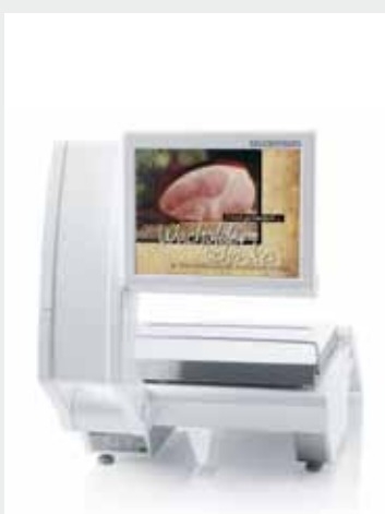
KH 200 2S Customer perspective