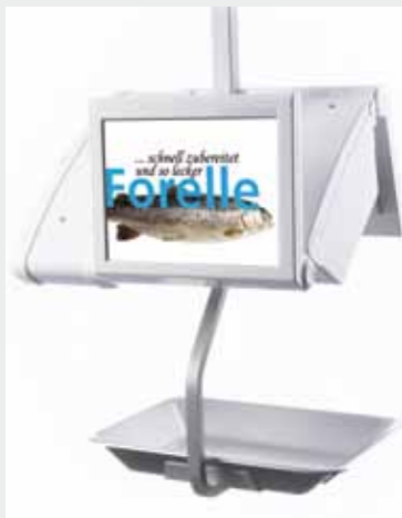
KH 400 2S Customer perspective