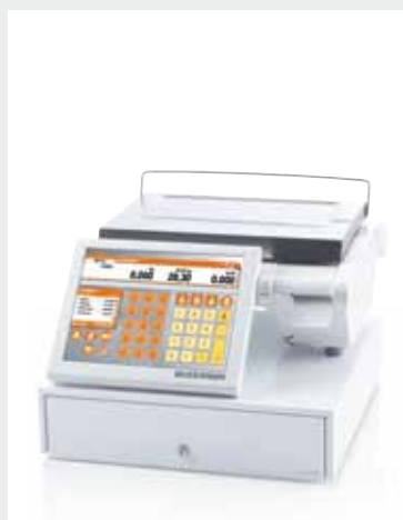
KH 100 with CD*