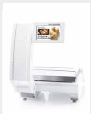
KH 200 Customer perspective