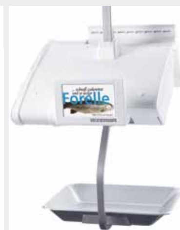
KH 400 Customer perspective