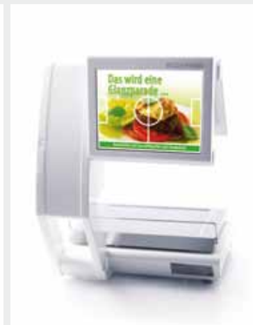
KH 800 2S Customer perspective