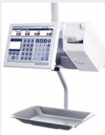
KH 400 2S