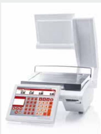
KH 200 2S