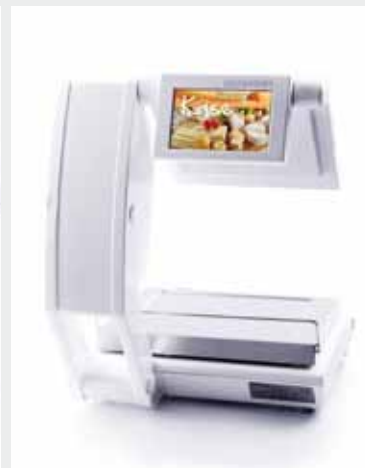
KH 800 Customer perspective